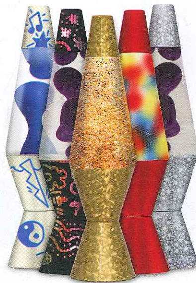
New Lava Lamps include a scratch off design, as well as 3D, holographic and graffiti effects.

Lifespan also has employed some colors designed to be masculine or gender neutral, green, for example. Green sells well but provides more incentive for purchasing Lava products for men, Courington said. To round out the new colors are several that have traditional feminine appeal, such as purple, gold and pink. HWB