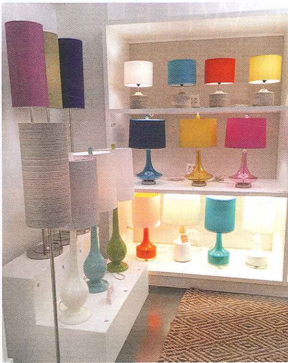
TOP LEFT: Imax has launched a Trisha Yearwood lighting and home décor line, including coastal styles.

In July, Surya launched a new 48-page lighting