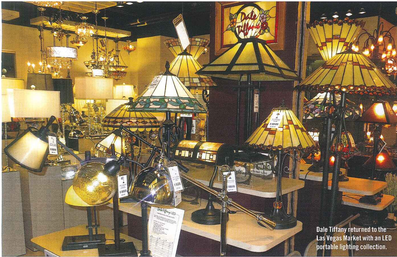
Dale Tiffany returned to the Las Vegas Market with an LED portable lighting collection.