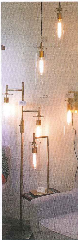
LEFT: Adesso's Dalton pendant lighting features retro Edison filament bulbs.

e-catalog. The catalog showcased a curated selection of Surya's newest lamp introductions followed by dedicated sections for table, task and floor lamps. At Las Vegas, the company continued its portable lighting push, highlighting several of the factors that it has emphasized, among them color. Surya included a range of boldly colored lamps as it increases its portable lighting assortment.